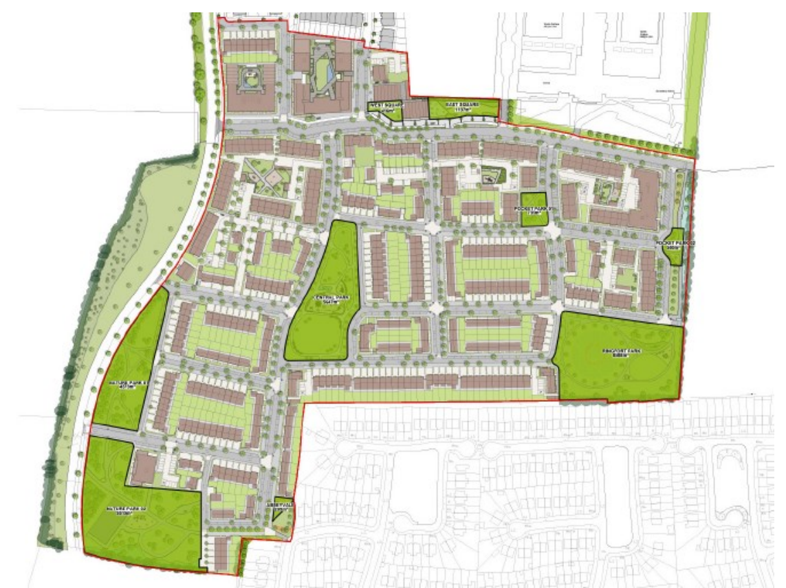
Figure 1. Location of 'Class 2' public open space within and adjacent to the development CCK Architects)

The play provision includes natural play, incidental play, formal playgrounds, callisthenics units and then play areas designed for the needs of very small children and their parents and guardians within the communal open space provided for apartments and duplex units. Formal play equipment is provided where appropriate as well as along the perimeter nature walk and likely to be an asset rather than a nuisance as play equipment in smaller spaces can be a problem in terms of noise for nearby houses. A local playground is to be provided in the Central Park and the Archaeology Park. Pocket parks offer generous spaces to accommodate an informal kick-about area. A much larger playground with different zones for younger and older children is to be developed in the regional park. This playground is co-located with the playing pitch, MUGA and a trail of fitness stations.